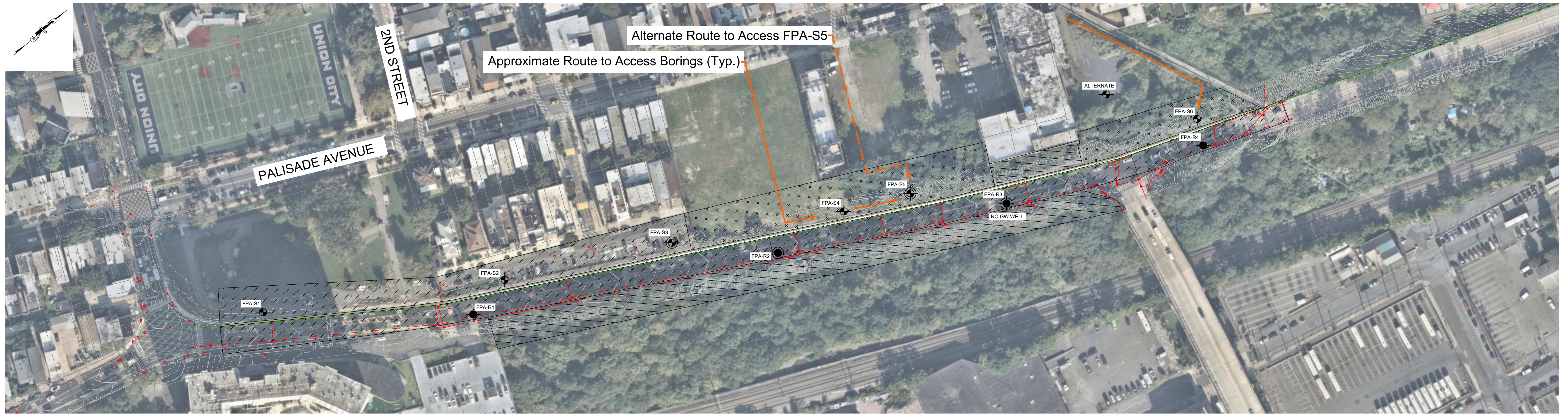
A OVERALL - SOUTH WALL SHEET 1 SCALE (FEET)